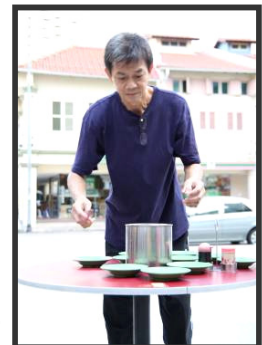
The uncle representing Ya Kun gets ready (right)

The first pit stop saw all teams pitting their egg-cracking skills against the lone but formidable uncle representing Ya Kun Kaya Toast. Each team was tasked to crack all twenty half-boiled eggs with as few broken yolks and shells as possible, and in the shortest time. Many found out later that breaking eggs may be easy, but preserving the firm yolk within required great skill!