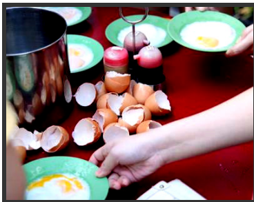
Teams scramble to crack perfect half-boiled eggs, but some with less than perfect results (top, above)

The clue cards given took all teams to other employers which hired on merit – including Wow Wow West and Eighteen Chefs. At Wow Wow West, a food stall located at ABC Brickworks food centre, teams learnt of the stall’s owner firm support of the Yellow Ribbon project, and that his chicken cutlet and chicken chop were two of the best western food dishes they had ever tasted! The teams also caused a slight commotion as other patrons crowded around to watch them piece together puzzles of the food items they were to order.