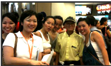
GMPians with a 75-year-old service staff from a fast food chain

Being in the business of Shaping Destinies, it was important to not only fortify relationships with our colleagues, candidates and clients, but also religiously practice what we, as an organisation, espouse – fair employment. What better way to energise our beliefs than organising an event centred on fair employment; team-building beyond the wallpapered walls of GMP's office. And we did it Singapore style – with food!