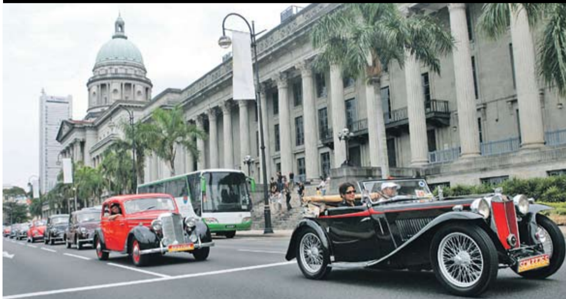
Singapore HeritageFest 2008 celebrated a slice of local motoring heritage by showcasing over 40 vintage beauties in a display near the Asian Civilisations Museum yesterday. These racing heroes of the past took turns to zip down Connaught Drive in a Grand Prix demonstration and later went on to do a lap on the F1 circuit. OOI BOON KEONG