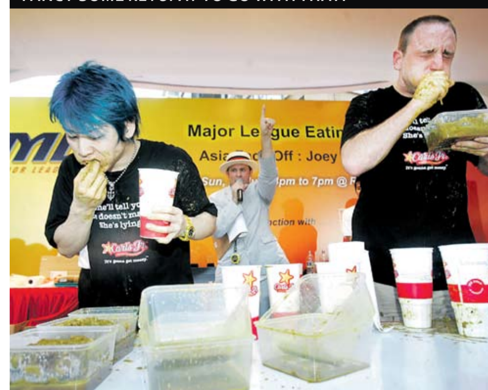
Mr Takeru Kobayashi of Japan (left) and Joey Chestnut of San Jose, California, seen here during the Major League Eating contest Asia Face-off in Singapore yesterday. Mr Kobayashi won the contest after consuming up to 5 kilogrammes of satay, beating the Californian by a whole kilogramme.